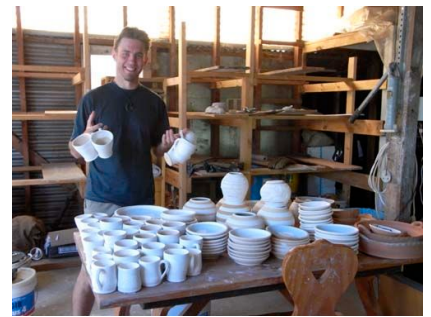
Phone (06) 377 4882