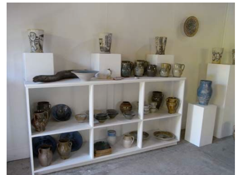
Some of the pieces in the show room. WAIS people can cover 50% purchase prices in Green $$.