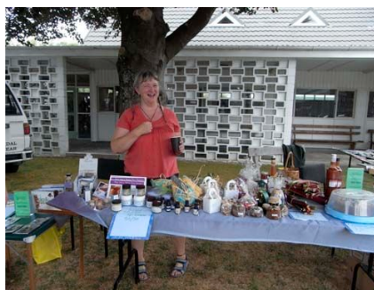
Sue always has an attractive goods and gifts display. Regulars know to get in early before the fudge sells out