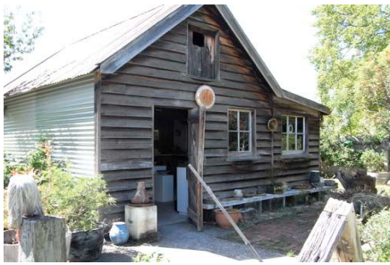
Studio & Showroom Masterton