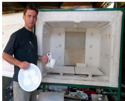
Best results come through, if a potter well knows his kiln, as a baker knows their oven.